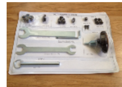
Set of tools (4)