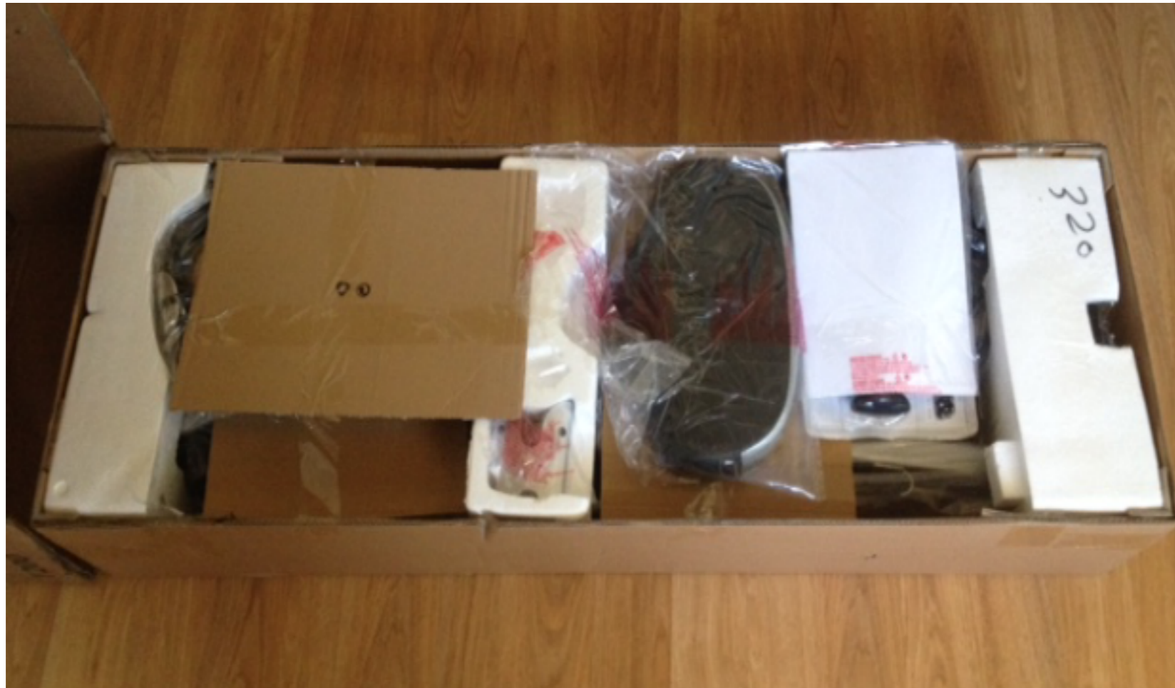
Bike components (2)