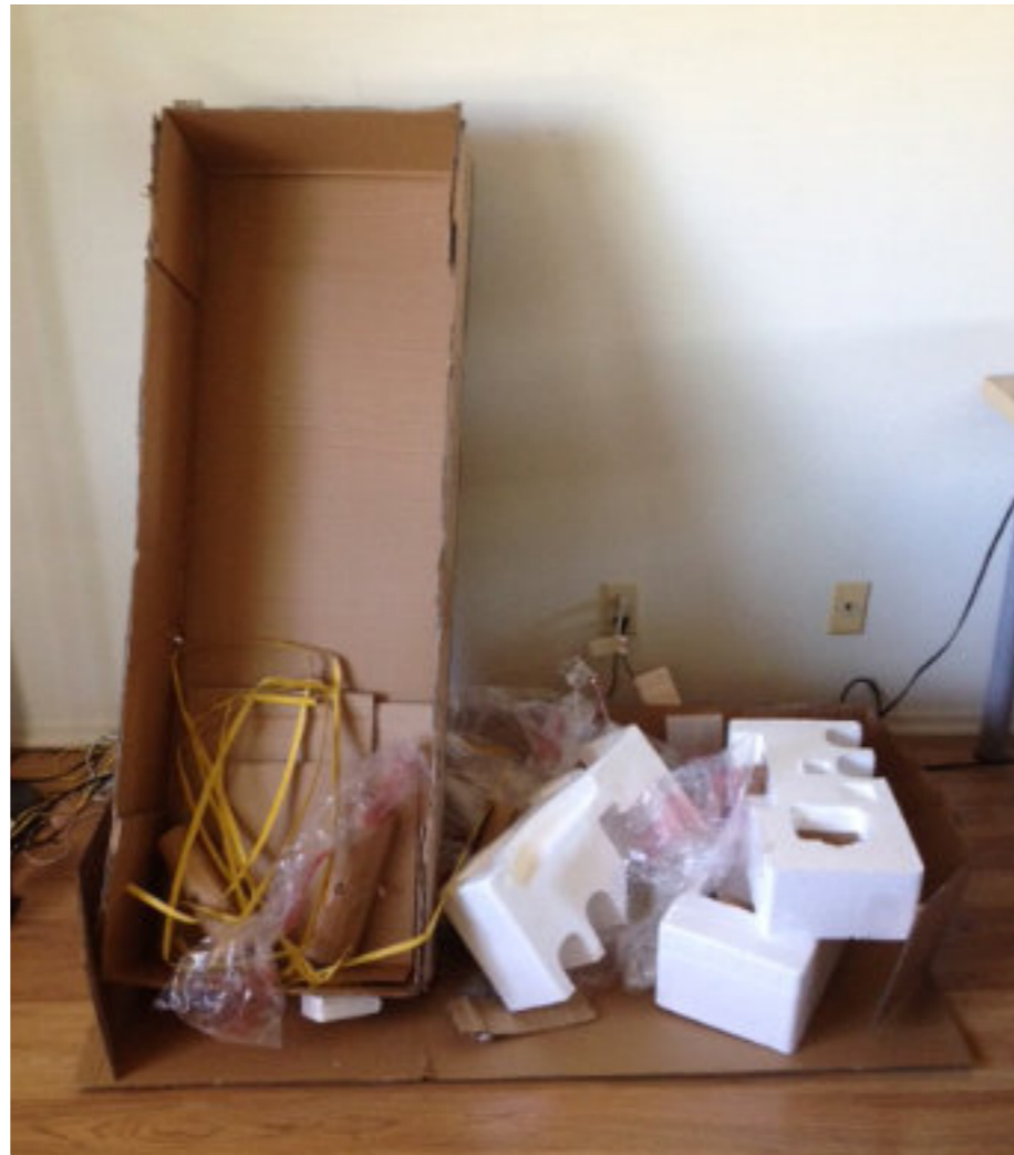
Trash and recycling (5)